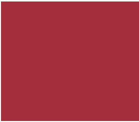
Medium Carmine HEX #AA3939 RGB (170, 57, 57)

The base color for both printed and web documents will be medium carmine . This color is the basis for the rest of the color choices. It will be used for smaller details such as links and captions. It will also be used as the background color for enclosed areas.